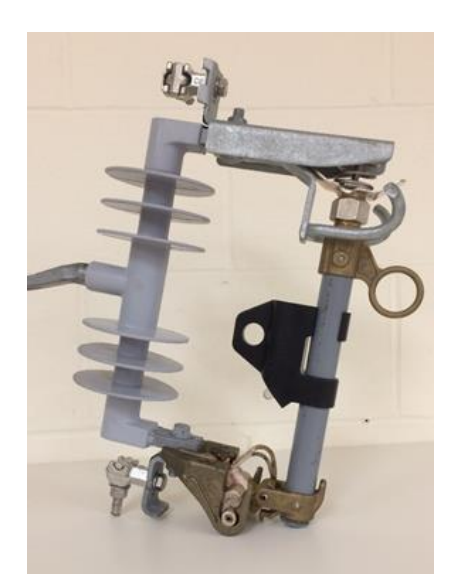
FireFly™ installed on fuse barrel